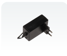
48 V 1.2 A power adapter