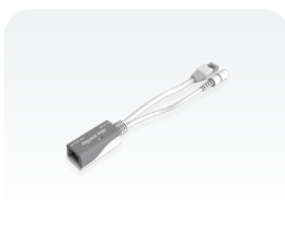
Gigabit PoE injector