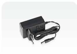
48 V 0.95 A power adapter