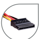
3X SATA POWER