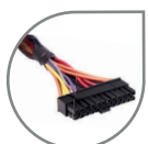
1X ATX 20 + 4