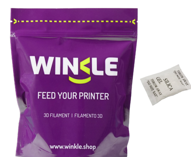
Reusable bag, spool and silica bag