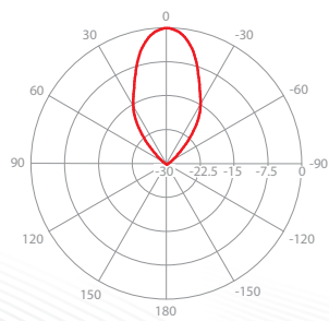
V/H - Port Pattern Azimuth 5.6 GHz